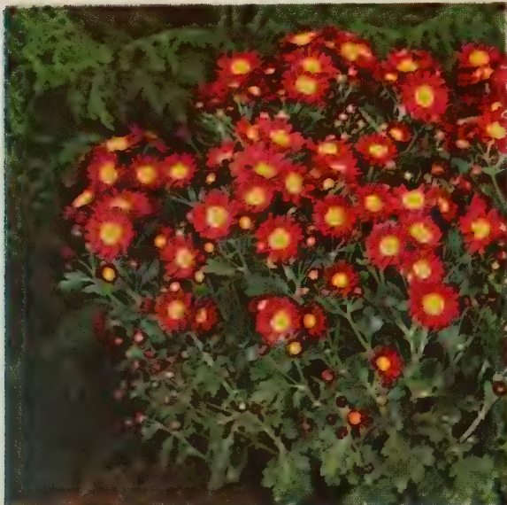
MISCHIEF. $1.00 each; 3 for $2.50

10 Popular Mums All tried and proved kinds that are sure to thrive in your garden. 10 Sure-to-Bloom Plants $4.80 (1 of each pictured)